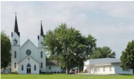
St. Paul's Lutheran (WELS) www.stpaulsplymouth.org 106 East Hwy 4 Plymouth, NE 402-656-3003